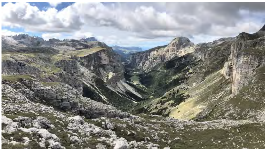
The glacial trough of Val Longaru